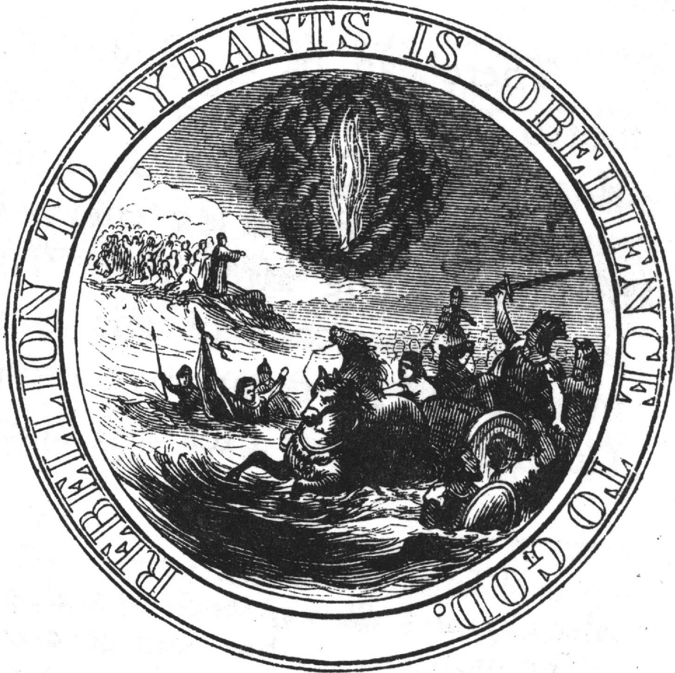
Jefferson's suggestion for a national seal