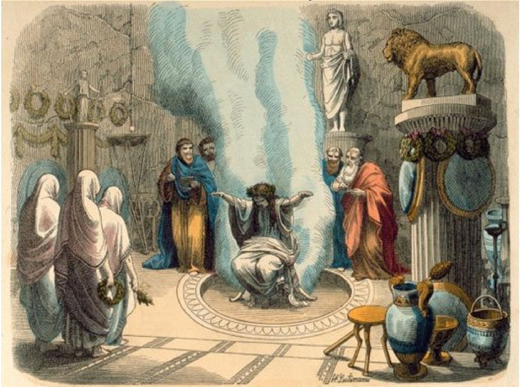
Das Orakel zu Delphi.