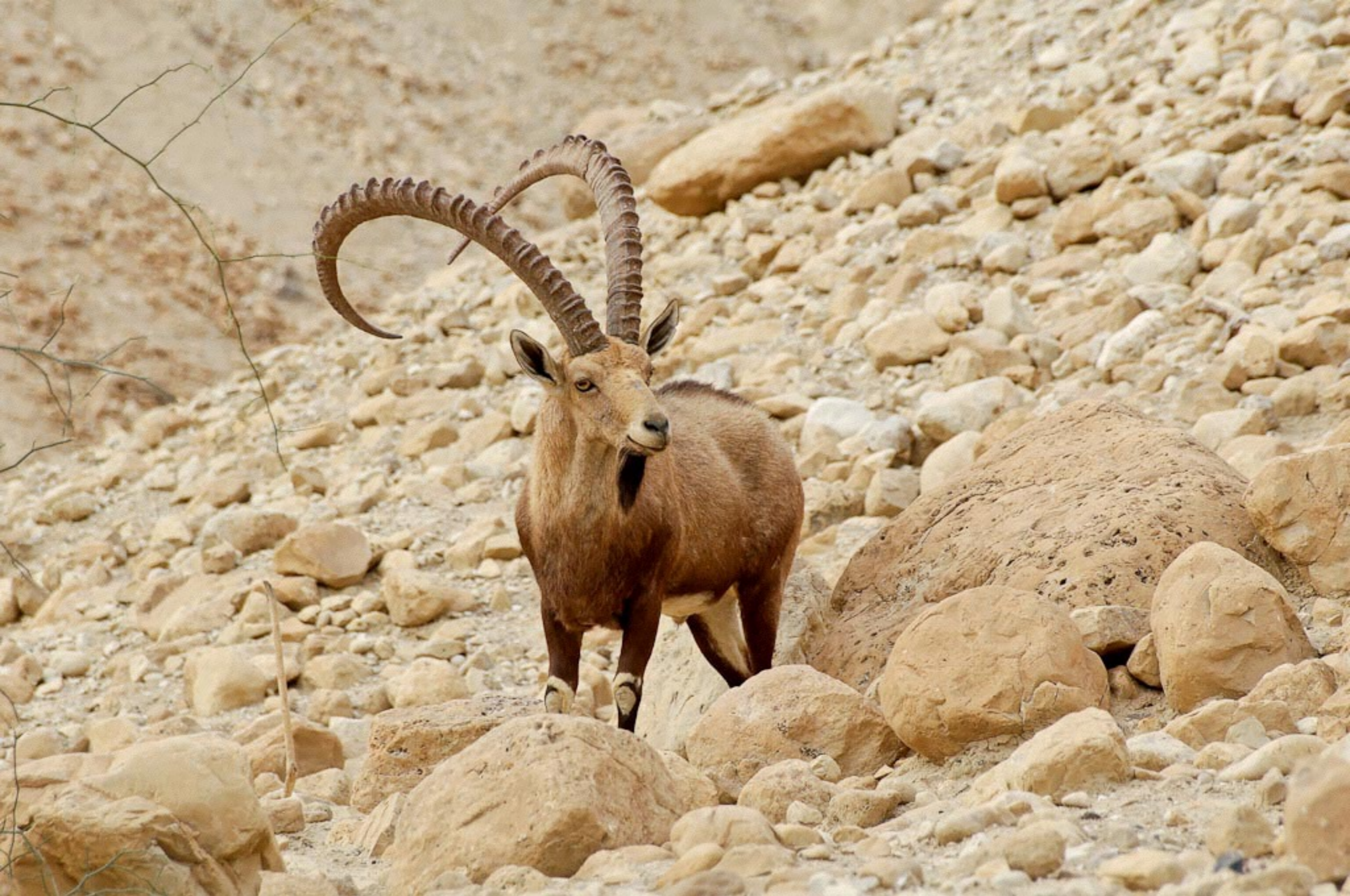
Ibex at En Gedi