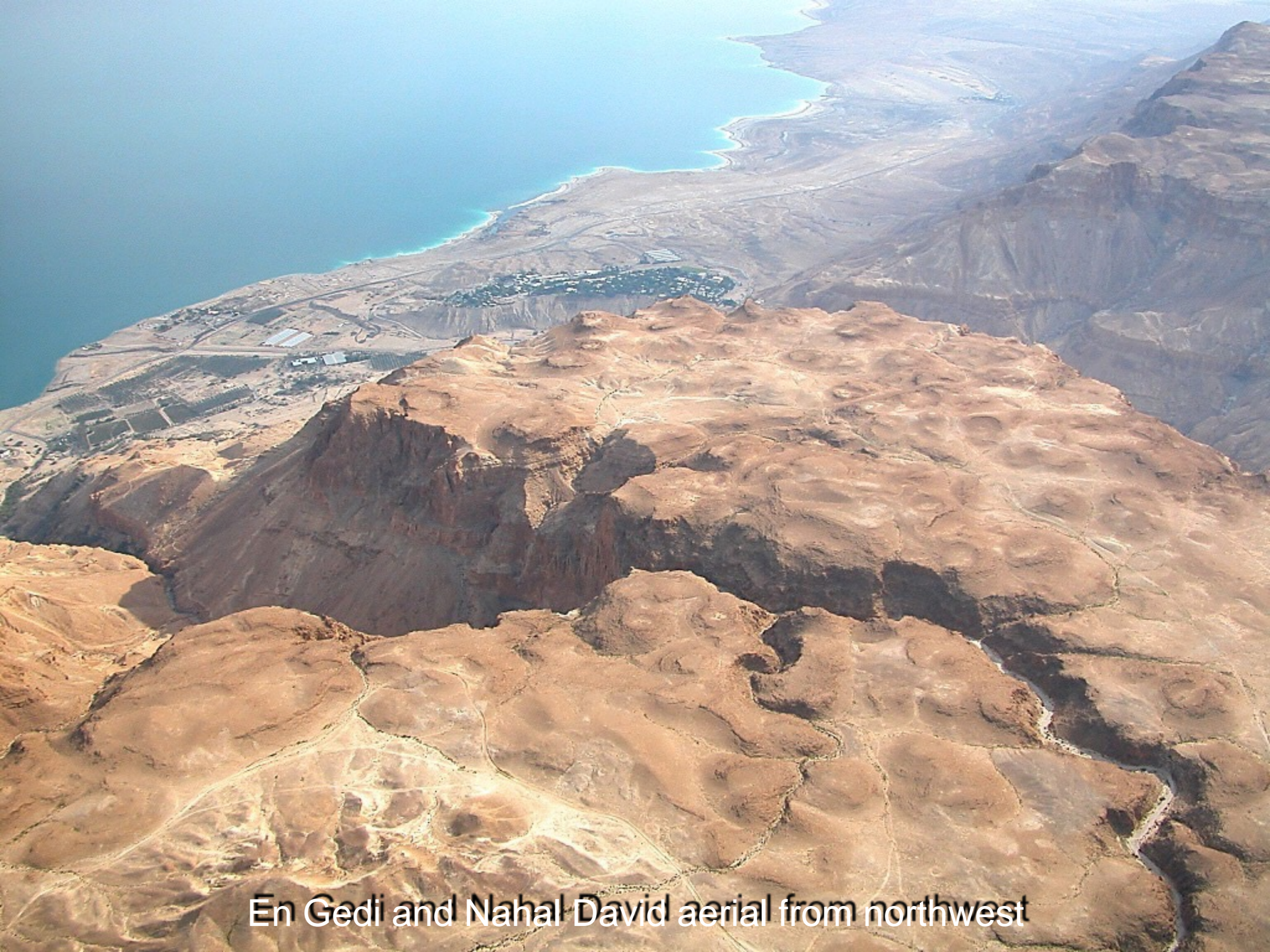
En Gedi and Nahal David aerial from northwest