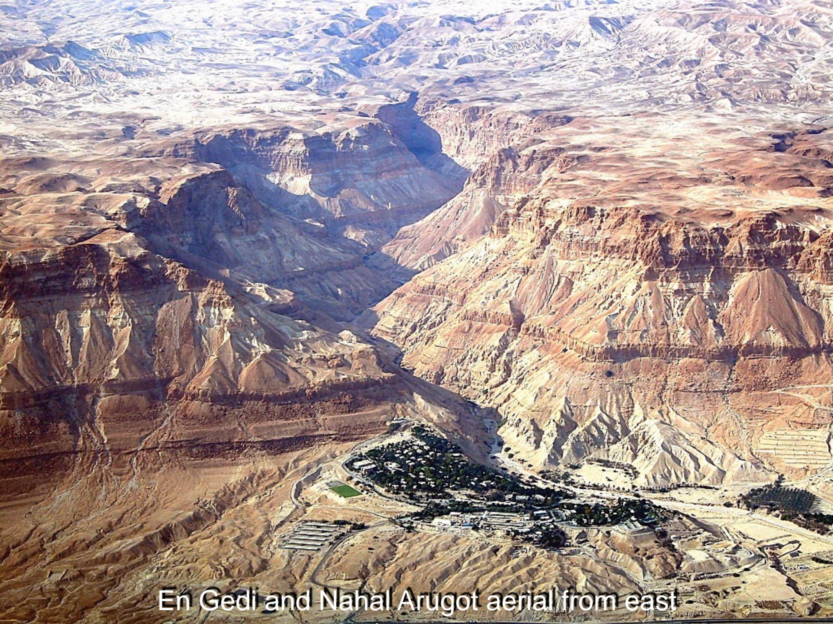
En Gedi and Nahal Arugot aerial from east