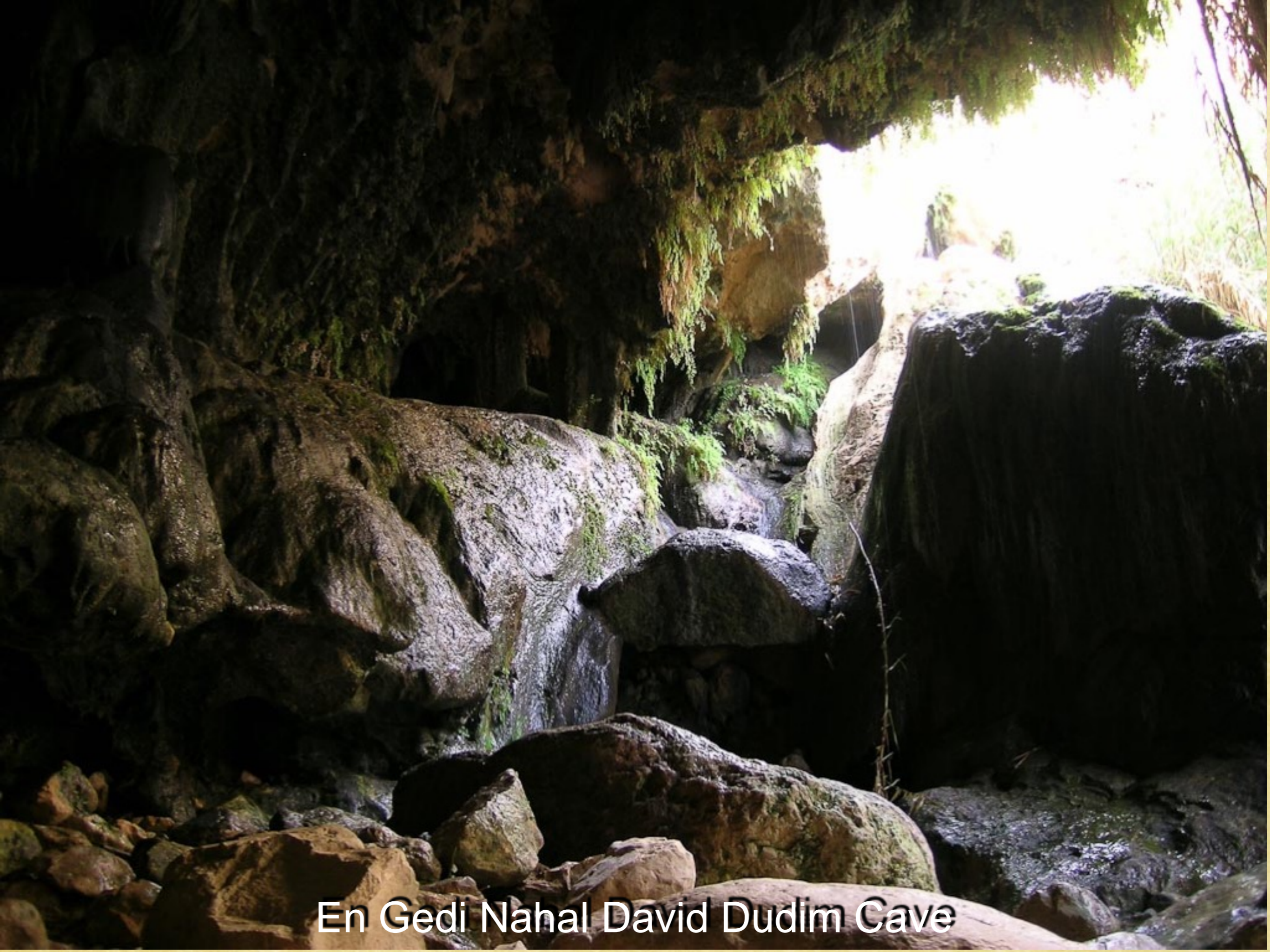
En Gedi Nahal David Dudim Cave