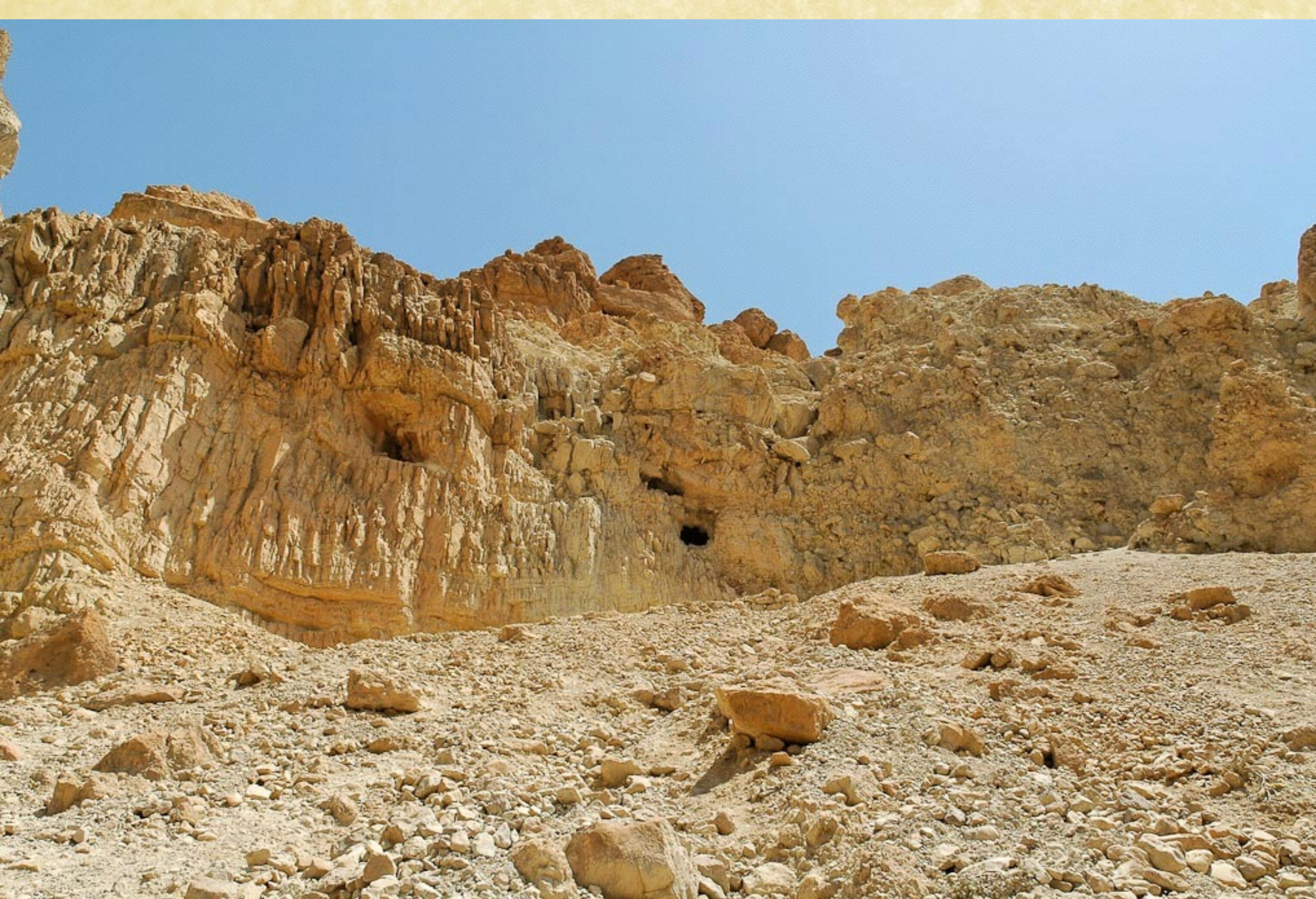
En Gedi Nahal David caves