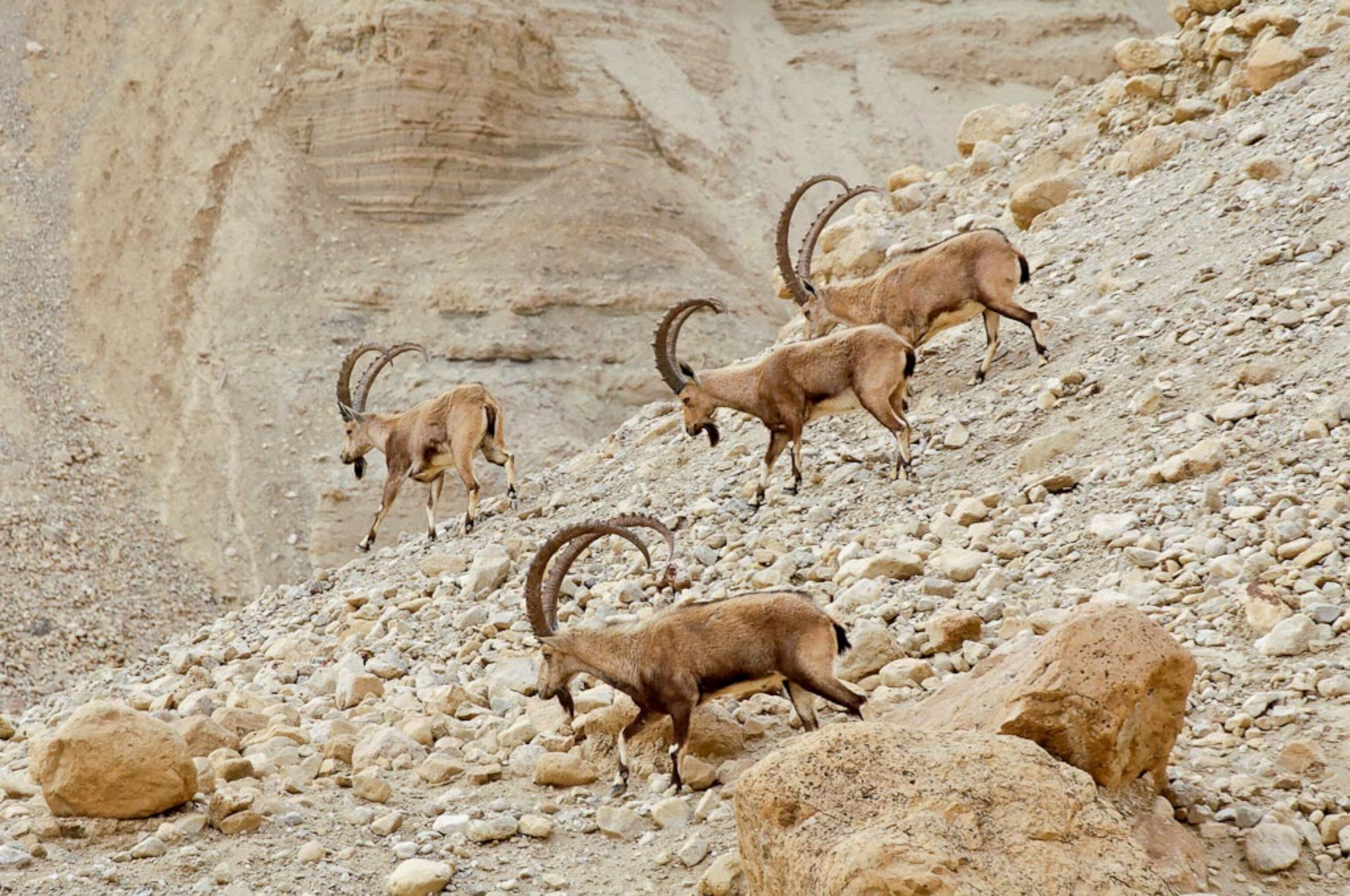
Ibex male herd at En Gedi