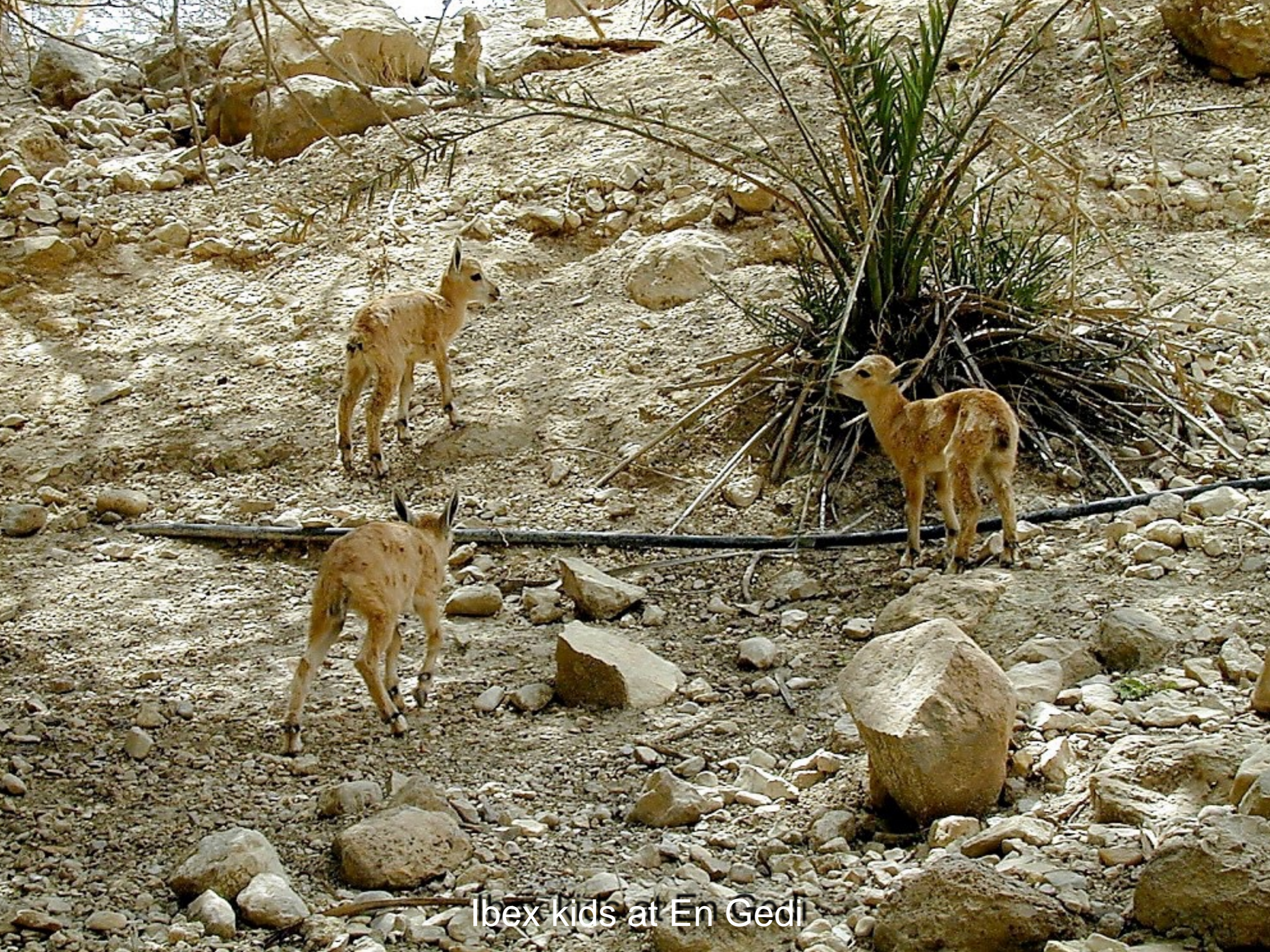
Ibex kids at En Gedi