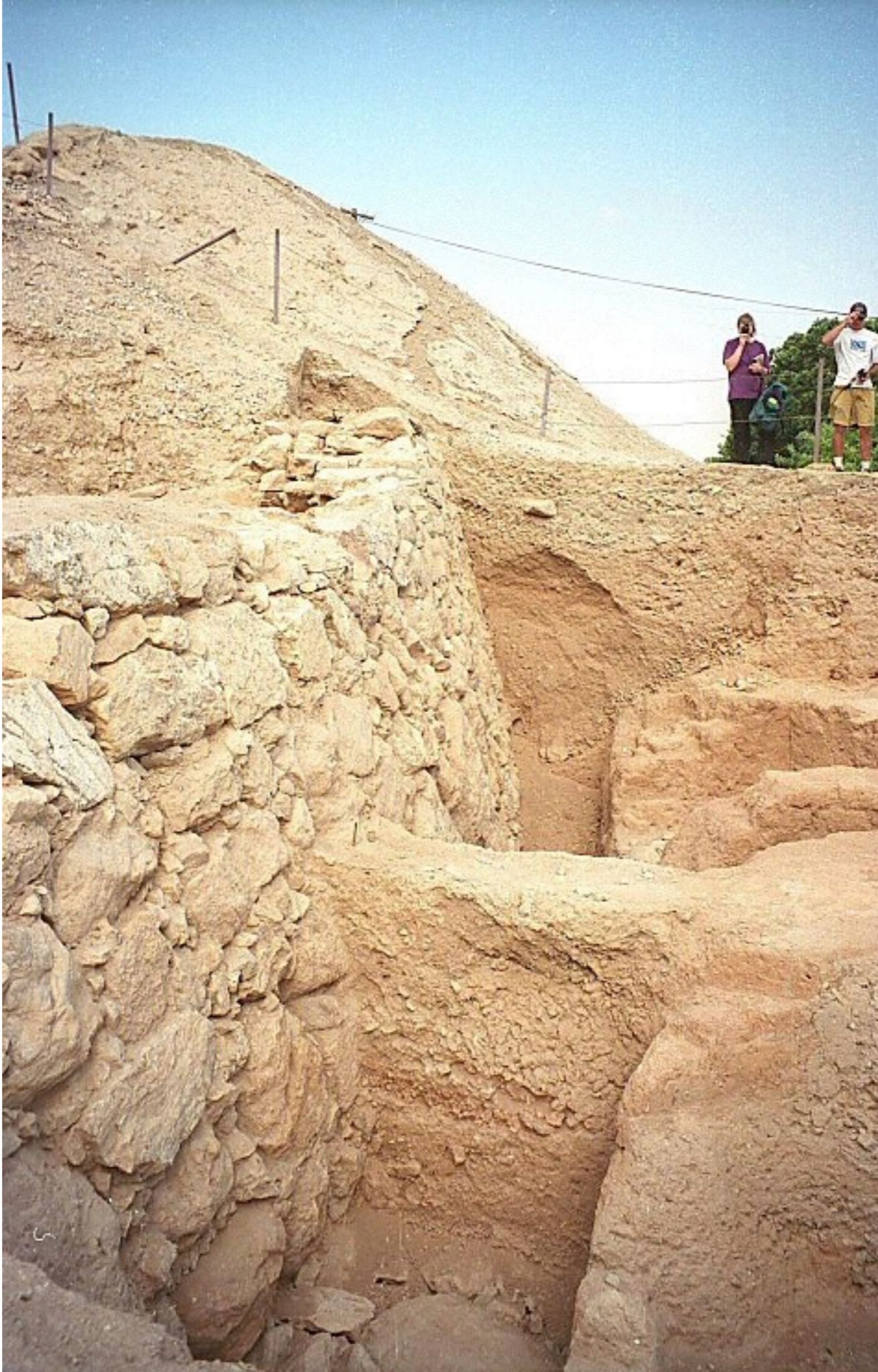
Jericho, Tell es-Sultan mudbrick collapse in front of revetment wall