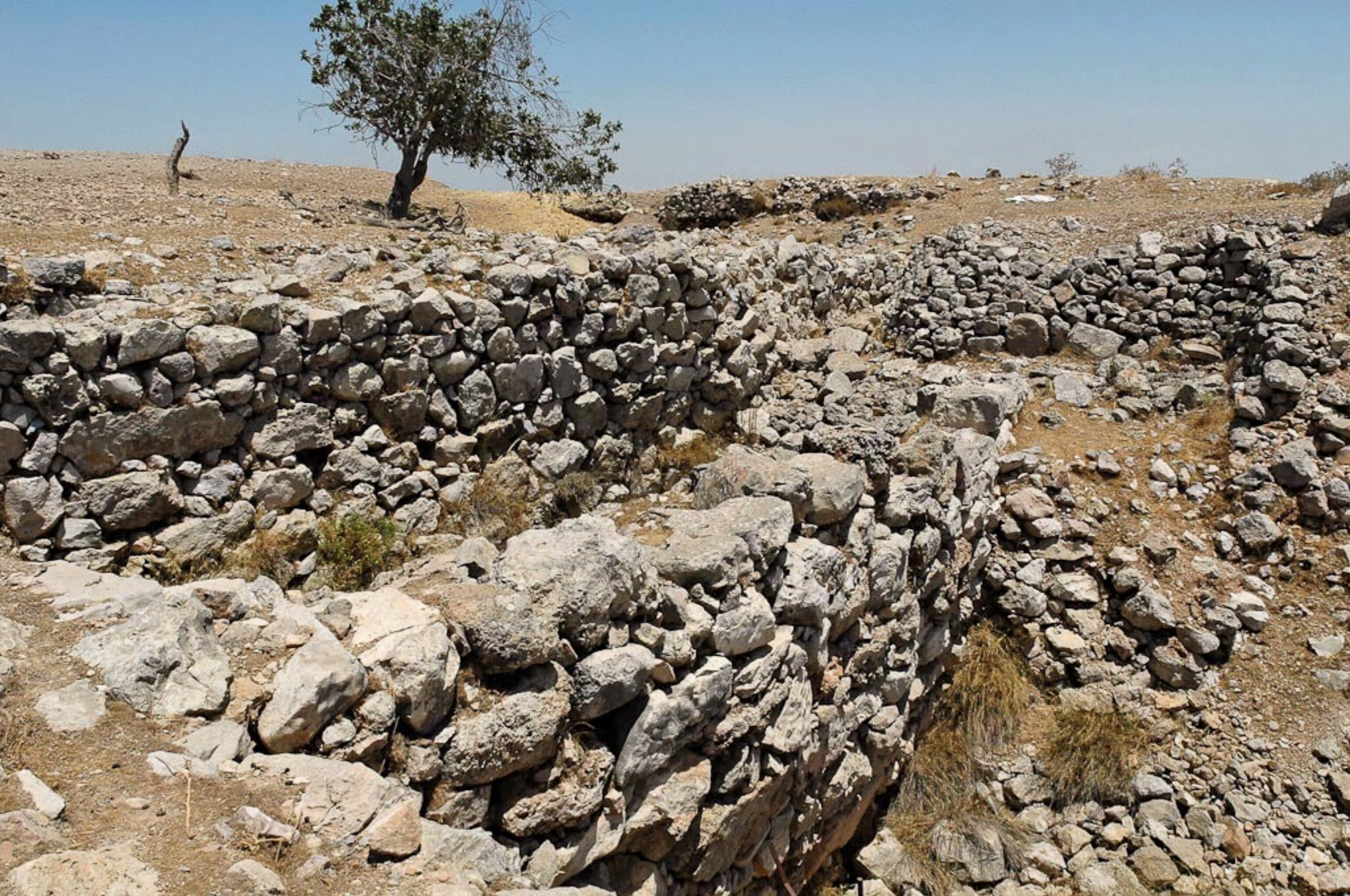
Et-Tell Early Bronze southern fortifications