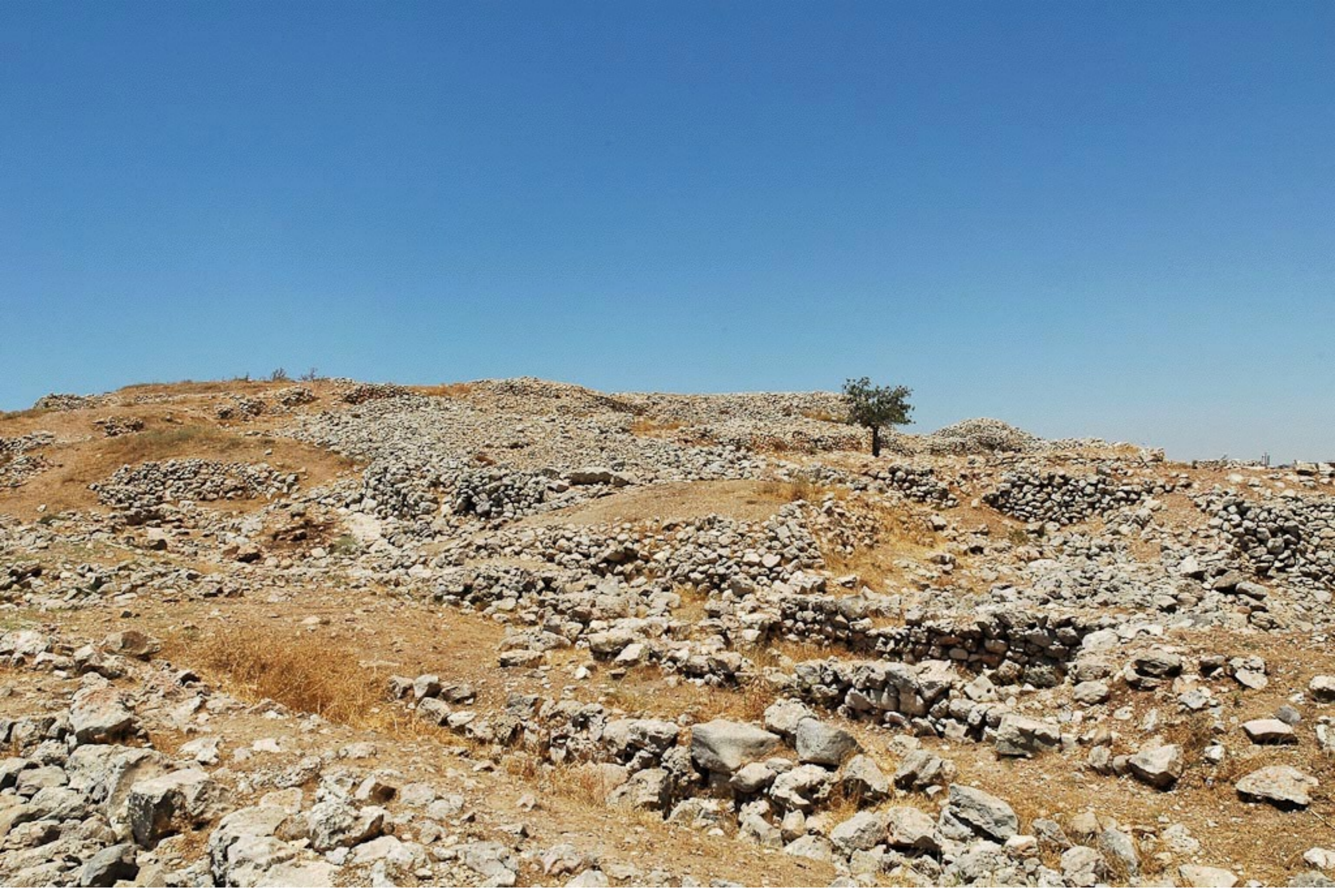
Et-Tell from south