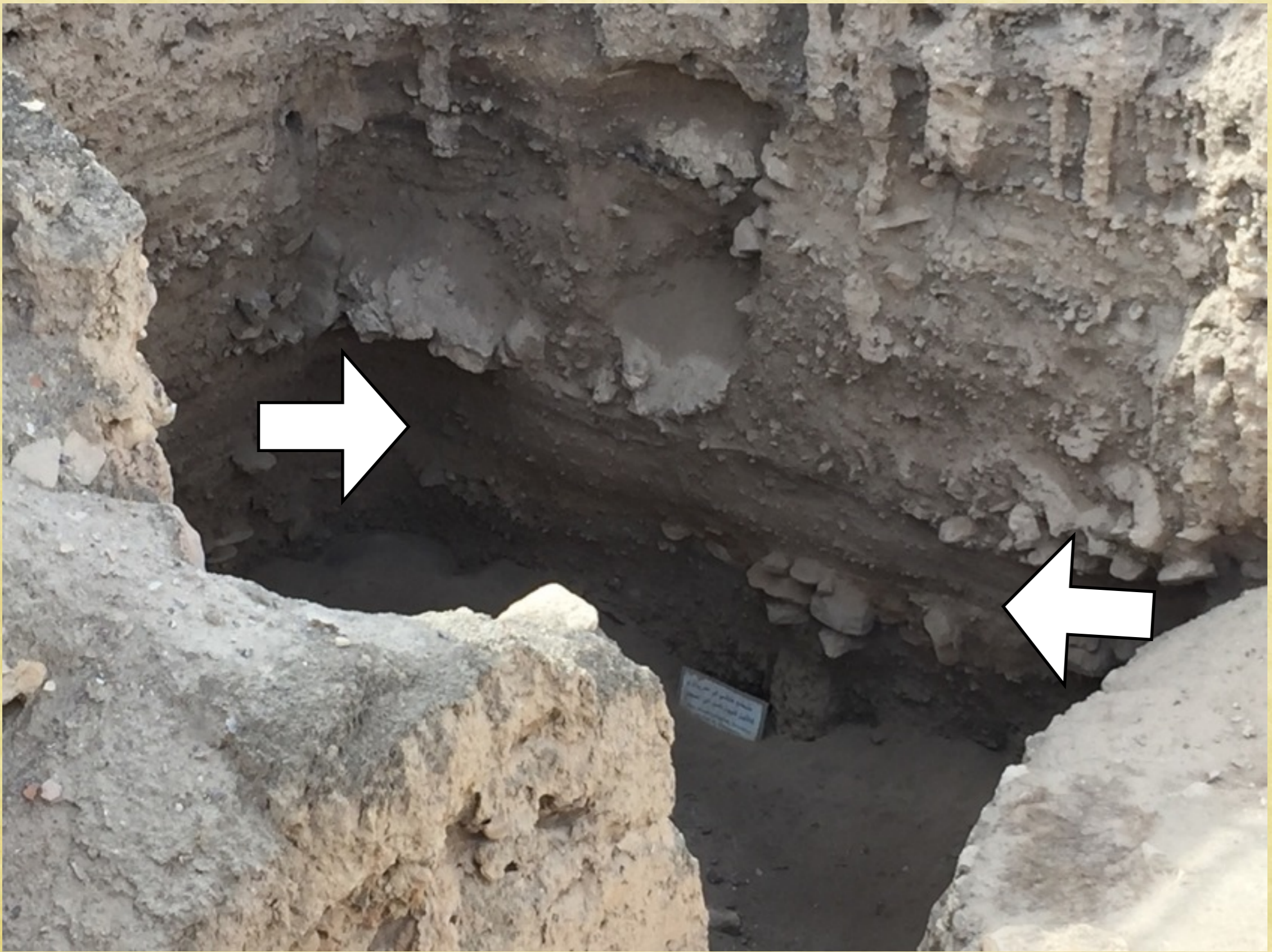
Jericho Burn layer