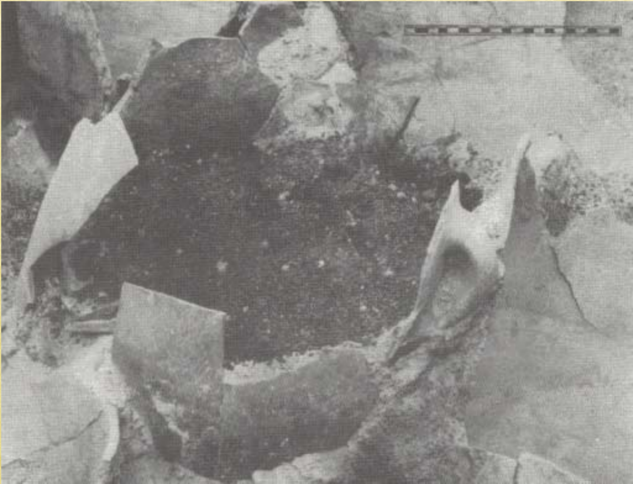
One of a number of storage jars full of grain found by Kathleen Kenyon in the final Bronze Age city at Jericho.