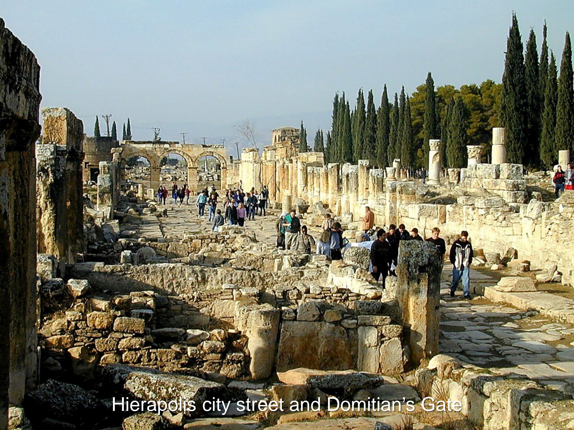
Hierapolis city street and Domitian's Gate