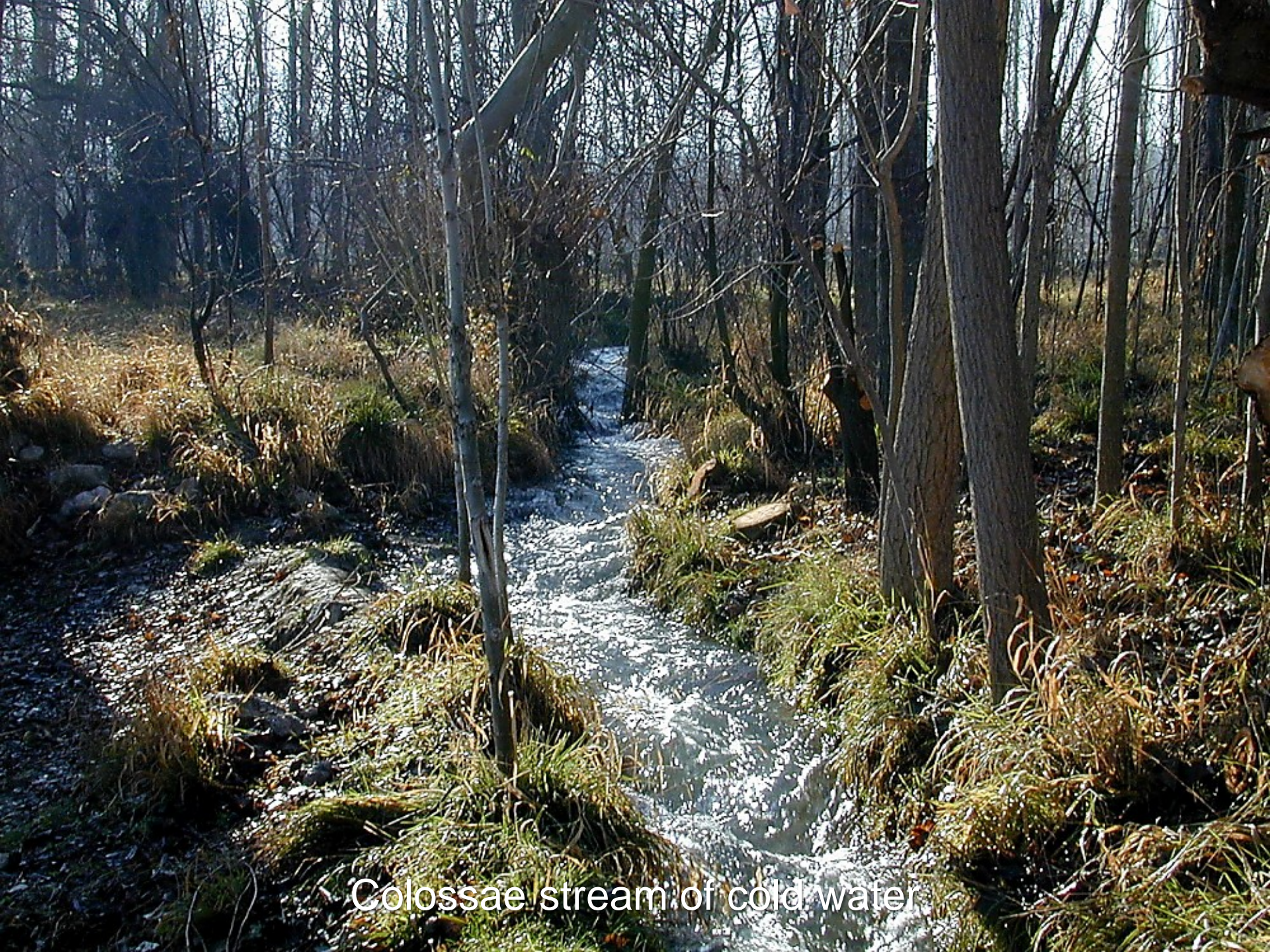
Colossae stream of cold water