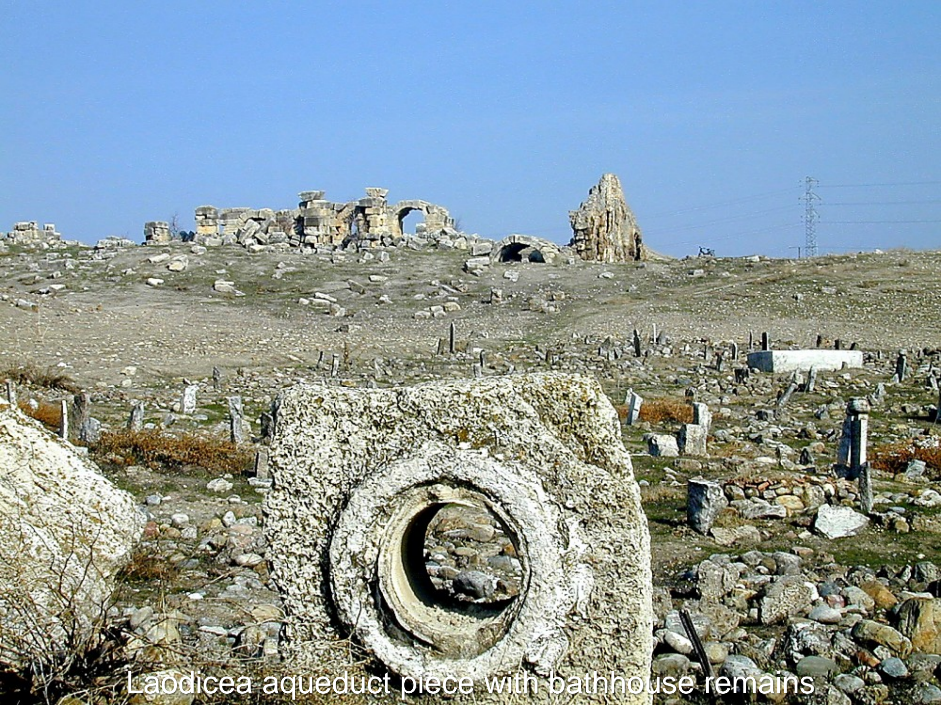
Laodicea aqueduct piece with bathhouse remains