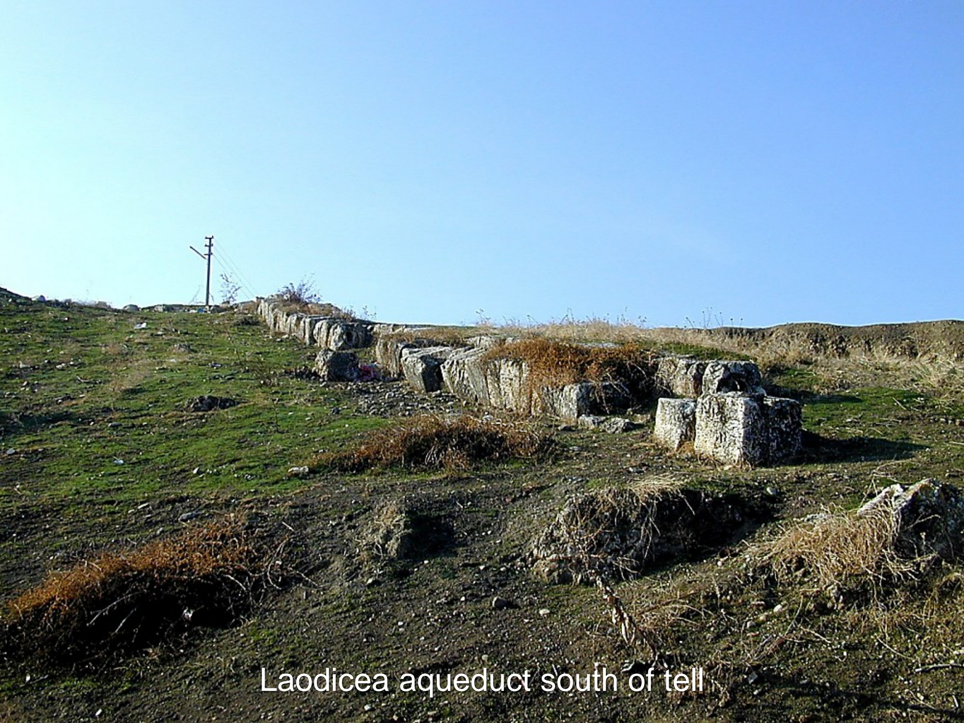
Laodicea aqueduct south of tell