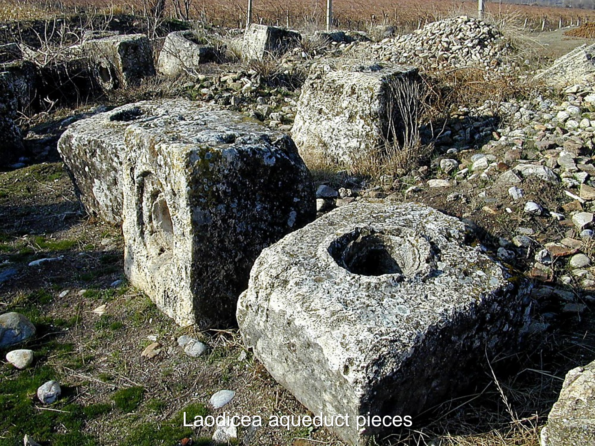
Laodicea aqueduct pieces