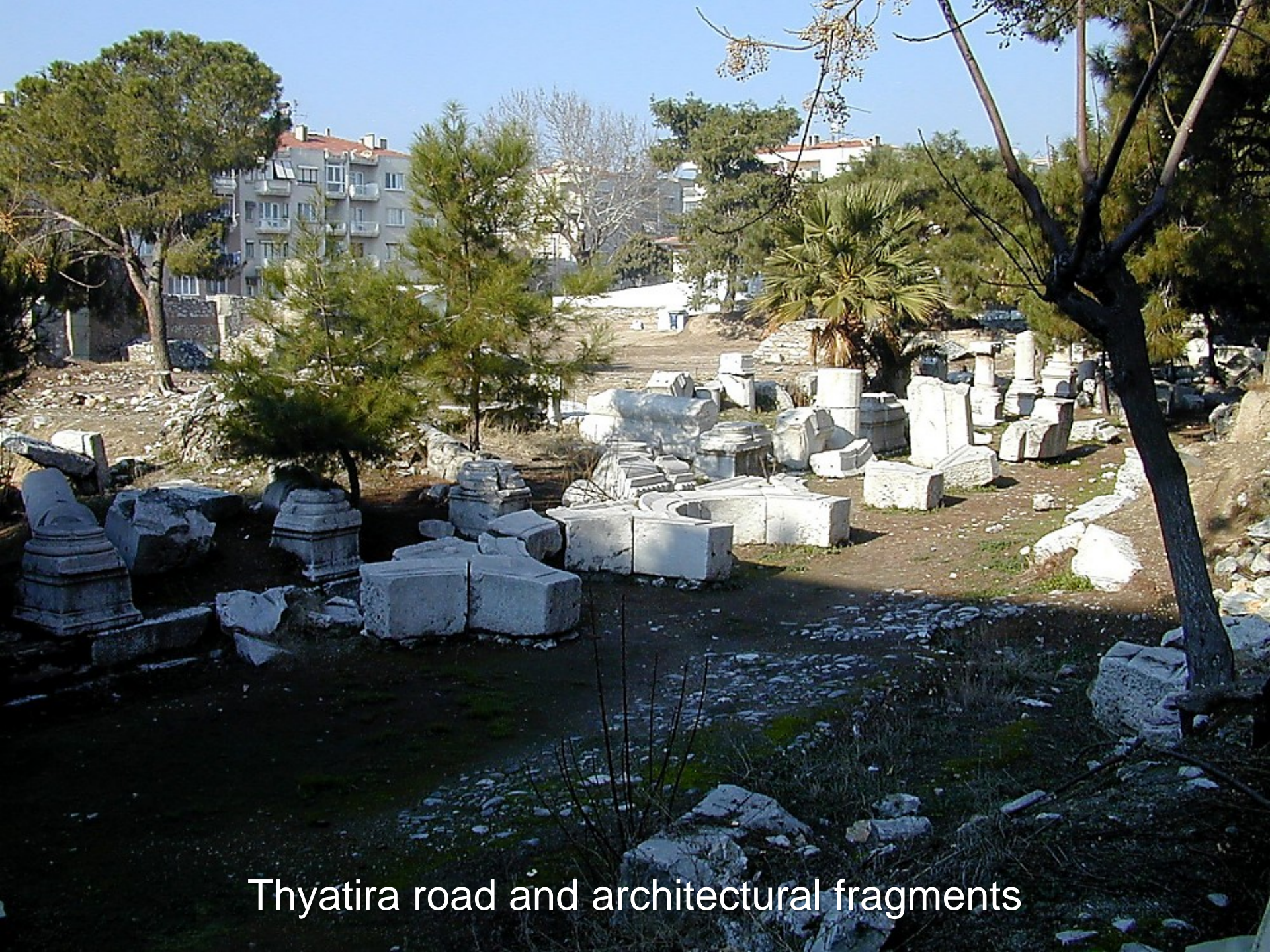
Thyatira road and architectural fragments